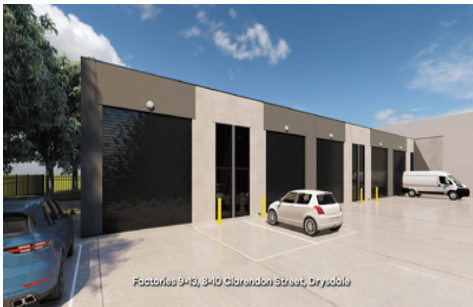
Factories 9-13, 3-10, Clarendon Street, Drysdale