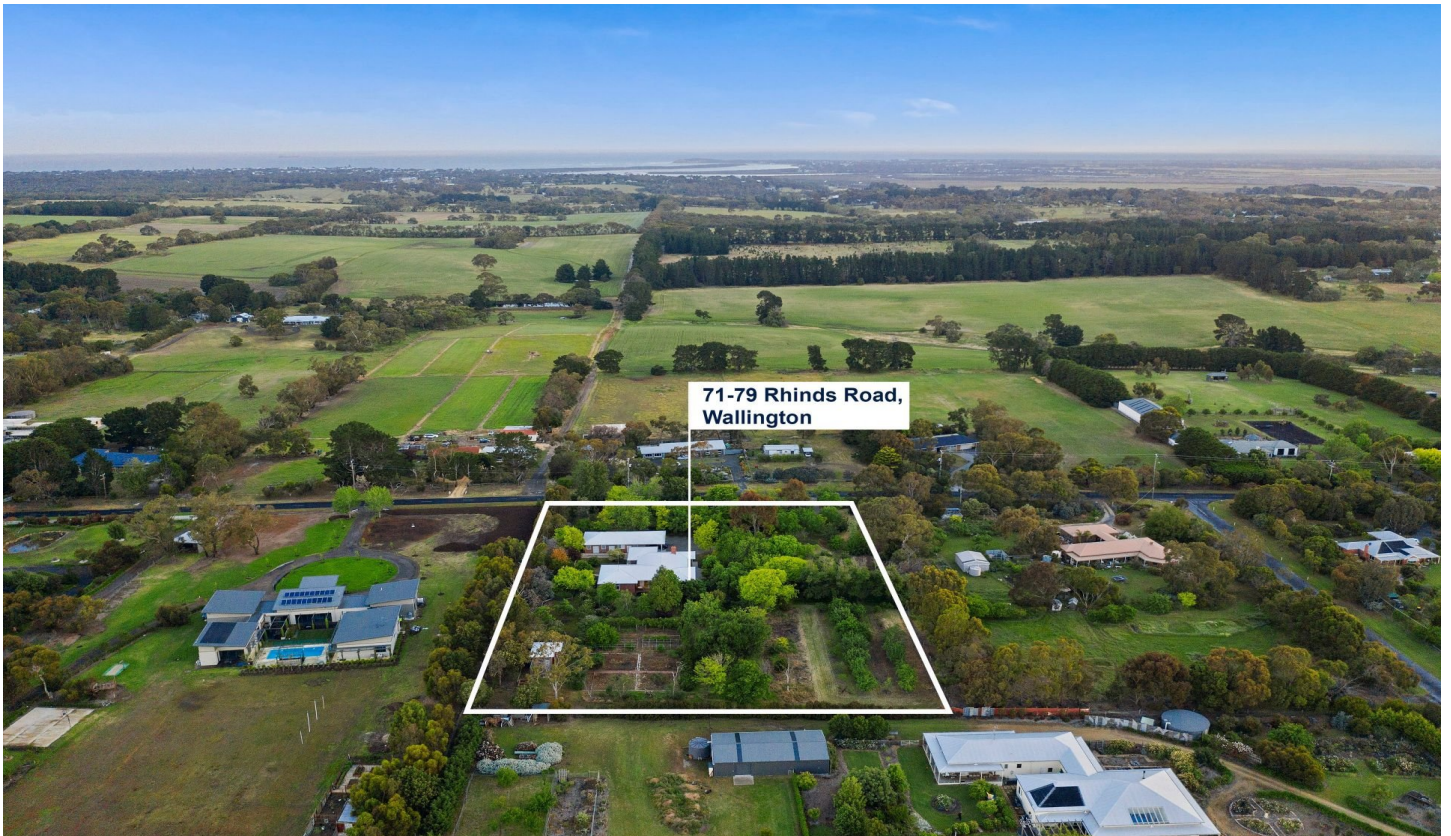
71-79 Rhinds Road, Wallington