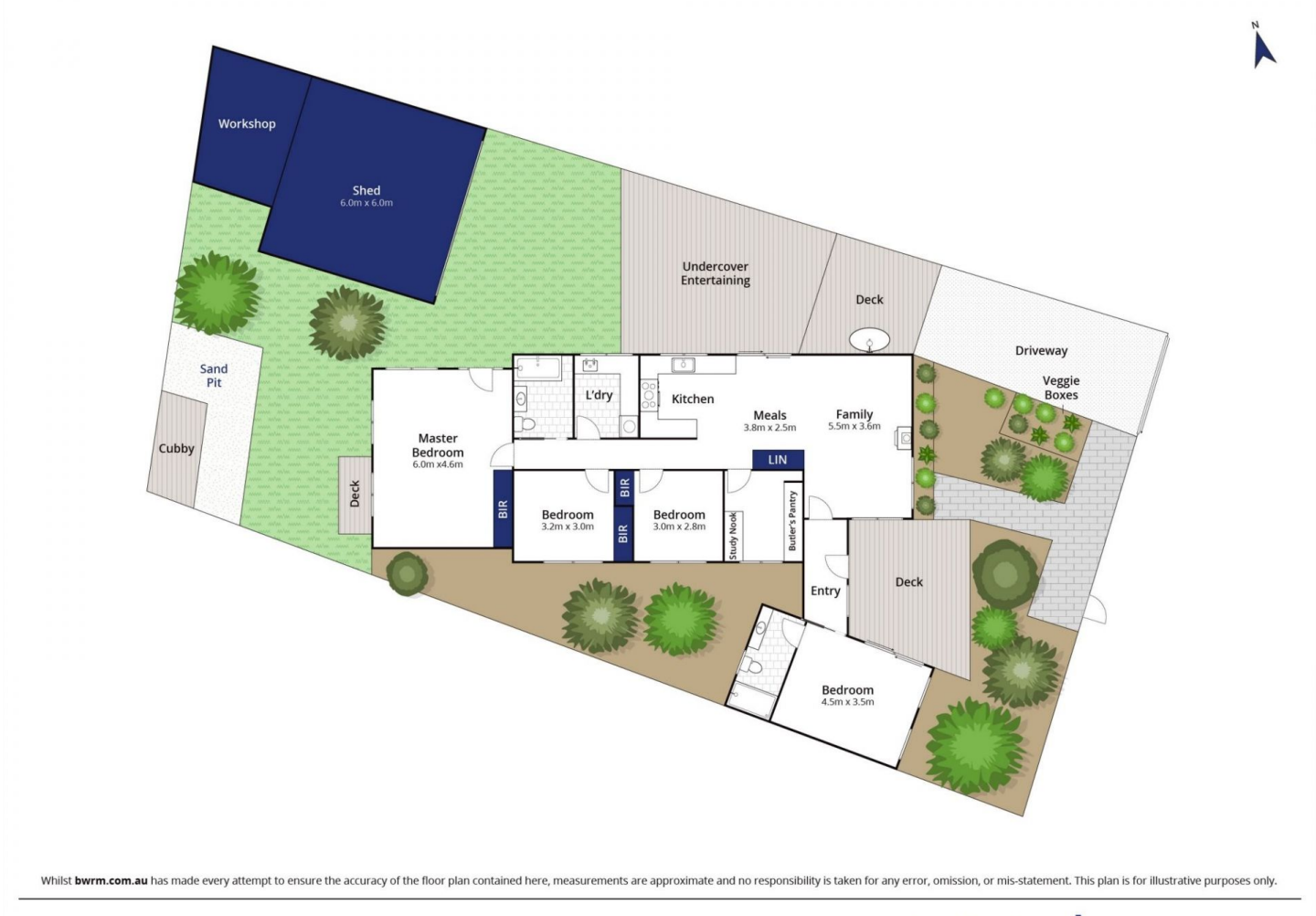
74 Endeavour Drive, Ocean Grove