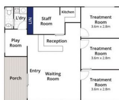
Offices (Not In Position)