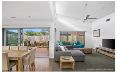
Example of Builder's previous work