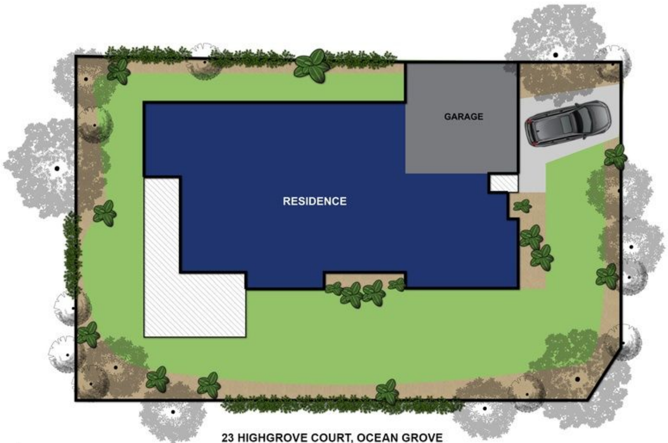
23 HIGHGROVE COURT, OCEAN GROVE