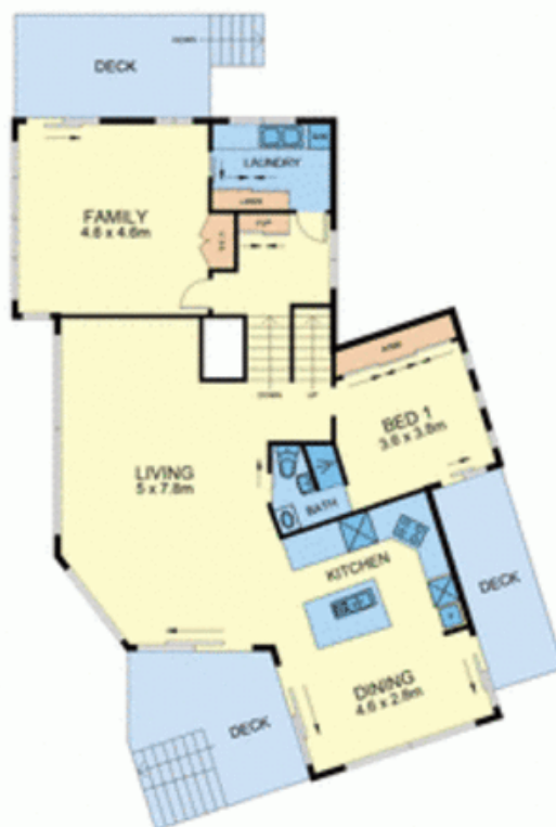
LEVEL 3 & LEVEL 4