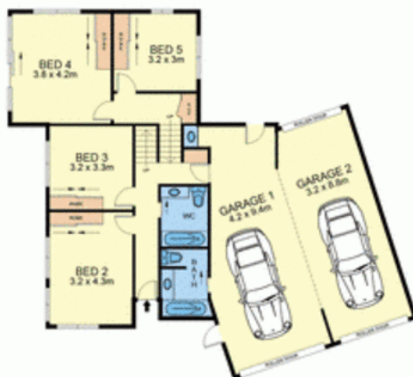
LEVEL 1 & LEVEL 2

NB: Land size and dimensions are approximate.