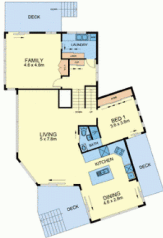
LEVEL 3 & LEVEL 4