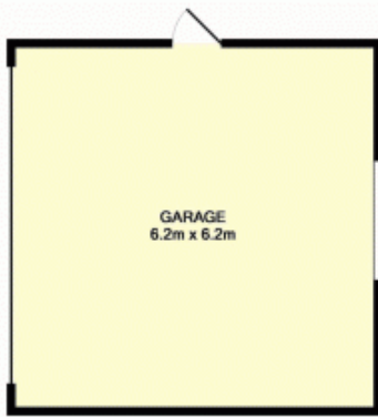
GARAGE 6.2m x 6.2m